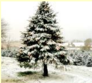
'Tis the Season

This 26 page booklet is produced each year by the Tennessee Housing Development Agency. Please download a copy for review and future referral.